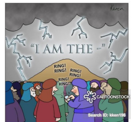
“Ever heard of vibrate?”

And, now that you’ve heard the meaning of Shavua, the greeting at the end of Shabbat, on any Saturday night, is Shavua Tov—may you have a good week.